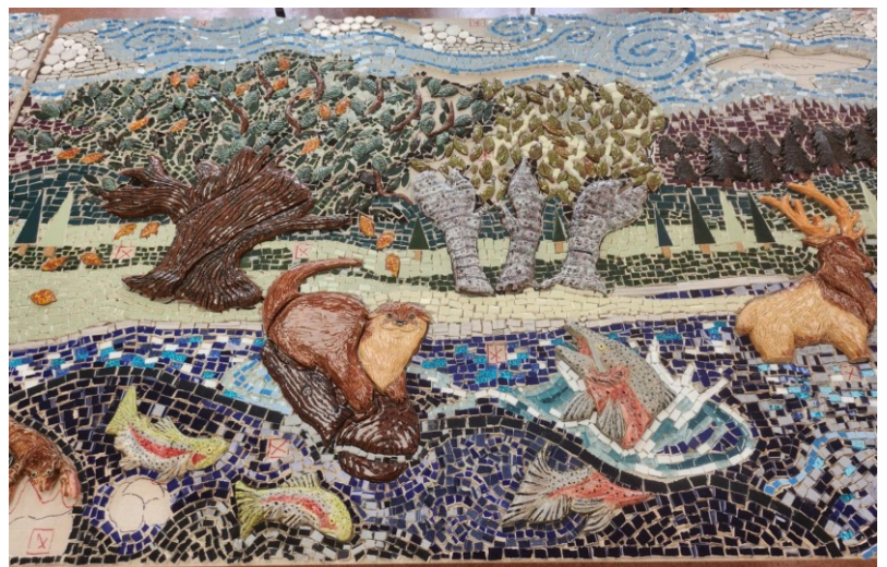
Most of the mosaic is shown here but is not grouted yet.