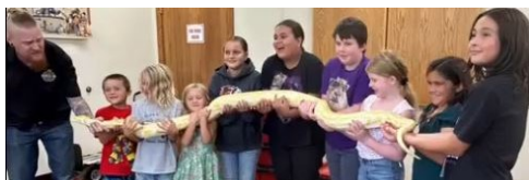
Above: Children holding boa constrictor.