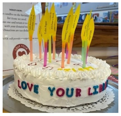
Pick a Candle for Giving!

*Post-It Notes (3") *Postage Stamps (Forever)