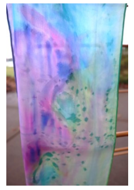
One of the 'painted' silk scarves made by the participants

The "Teens Make It!" program was attended by 12 young adults who crafted beautifully 'painted' silk scarves using Sharpie markers and rubbing alcohol to give a tie-dye affect. They also created tiny terrariums in clear Christmas balls; mini succulent gardens; and bookmarks using shaving cream!