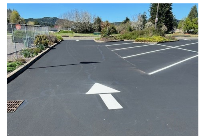
Large arrows help direct traffic one-way through the parking lot.

The Lincoln County Cultural Coalition provided $1,600 via an SVFOL grant request and Lincoln County (continued on Page 2, "Parking Lot")