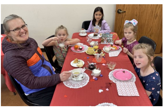
Library patrons enjoying a "proper tea" party